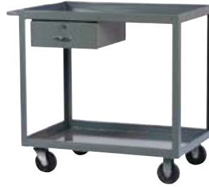
RMD25T5SR w/optional drawer