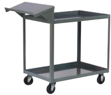
RMD25T5SR w/optional writing shelf